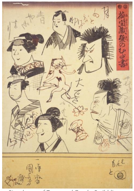
Storehouse of Treasured Goods: Scribblings on the Wall, Ichiyusai [Utagawa] Kuniyoshi, National Diet Library, Japan